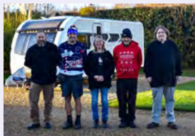
Bath Chew Valley Somerset

We regularly feature the owners and teams at our holiday parks on our blog via our 'Meet The Owners' series. All our locations are family/independently owned and run and we'd like to showcase the characters who make Best of British what we are. Say 'hello' to the people that make us so unique!